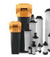
Filters & Housings