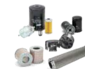
Fuel & Oil Filters

Of course we have much more in our range.