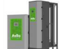
Membrane Gas Generators