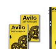
Tire Inflation Systems