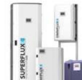
Lab Gas Generators