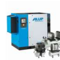
Screw & Piston Compressors