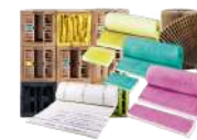
Paint Collection Filters